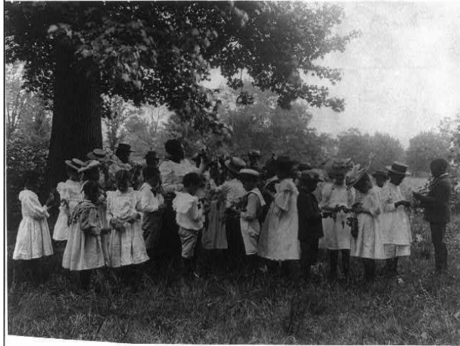
African American school children and teacher, studying leaves out of doors