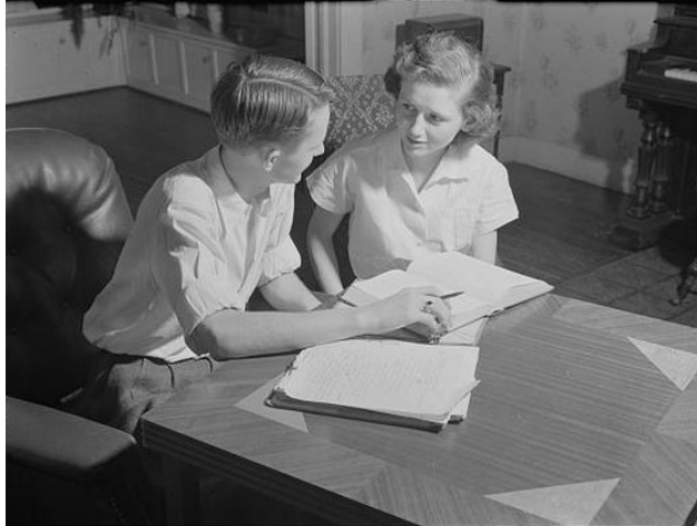
One of the teachers in the school helping her brother, a pupil, with his studies.