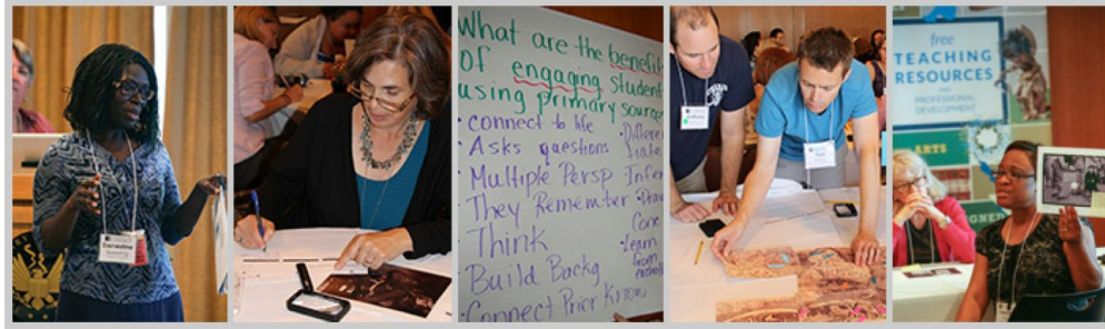
Library of Congress Teacher Institutes and Seminars